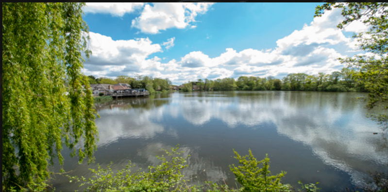
Fleet Pond/Nature Reserve

A selection of photographs showing various locations in and around Fleet are shown below.