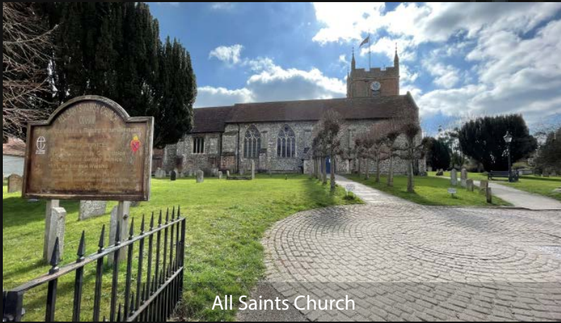
All Saints Church

Road links are excellent within the local area and the M3 access is within 2 mile of the property.