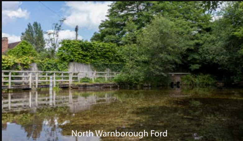
North Warnborough Ford