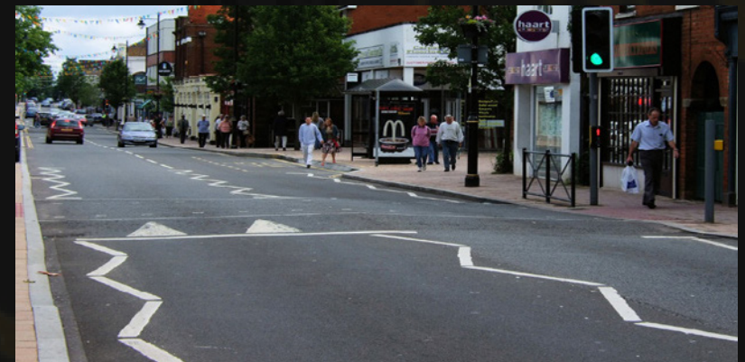
Fleet High Street