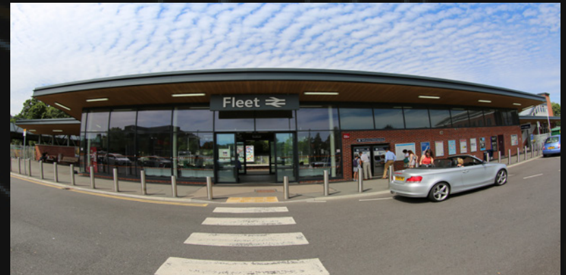
Fleet Mainline Railway Station