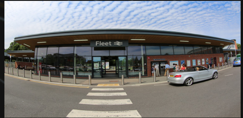
Fleet Mainline Railway Station