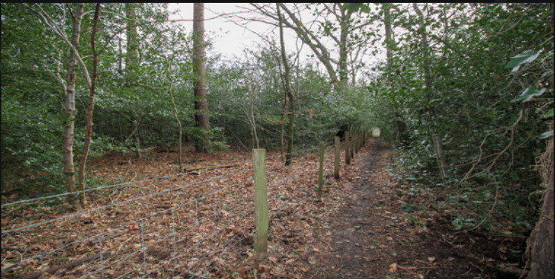
Woods Backing onto Fleet Pond