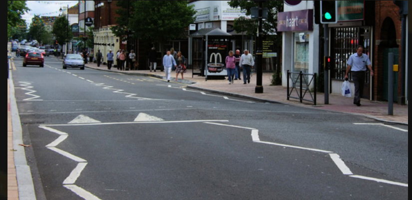
Fleet High Street