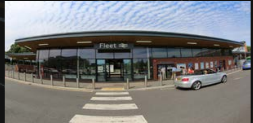
Fleet Mainline Railway Station