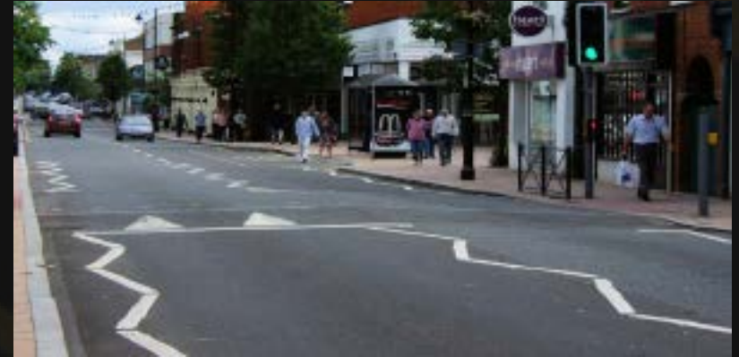
Fleet High Street