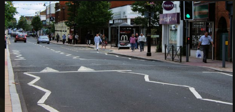
Fleet High Street