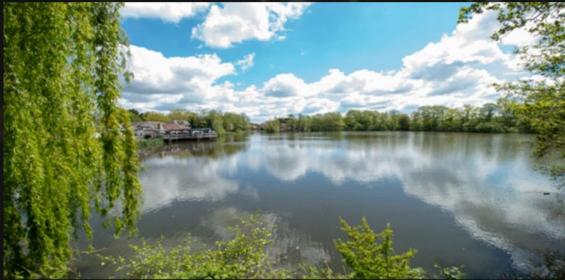
Fleet Pond/Nature Reserve

A selection of photographs showing various locations in and around Fleet are shown below.