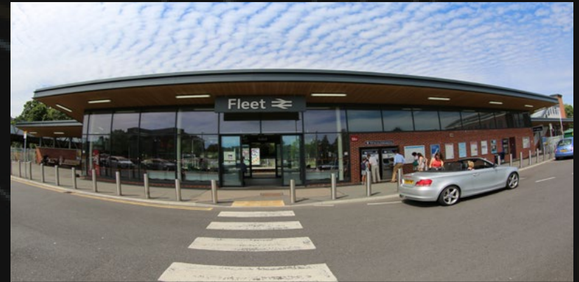
Fleet Mainline Railway Station