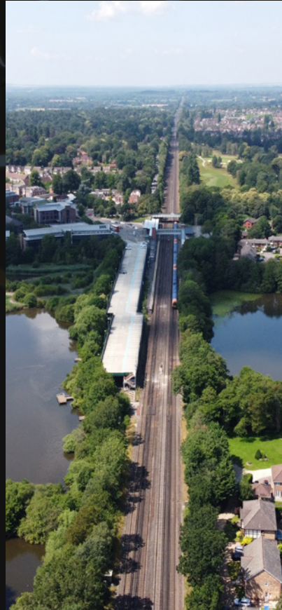
Fleet Rail Line