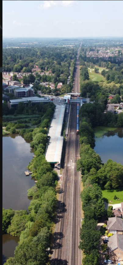
Fleet Rail Line