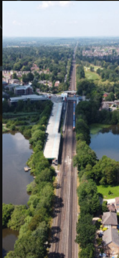
Fleet Rail Line